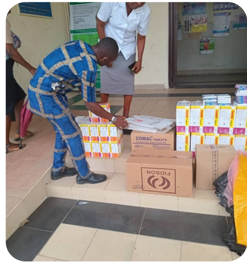
Distribution of commodities at Ikwerre health facilities