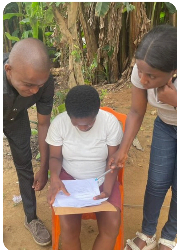
Advocacy Visit to Omagwa