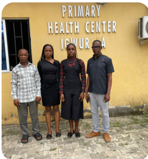
Monitoring and Evaluation field visit to Igwurata