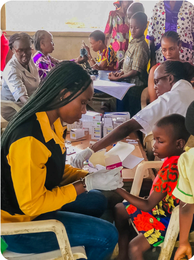
Omerelu Malaria Outreach